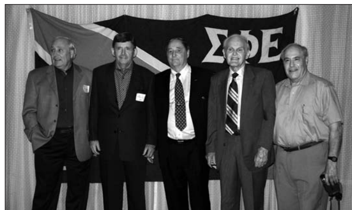
Five Indiana Zeta charter members at the 50 th Anniversary Banquet in October 2006